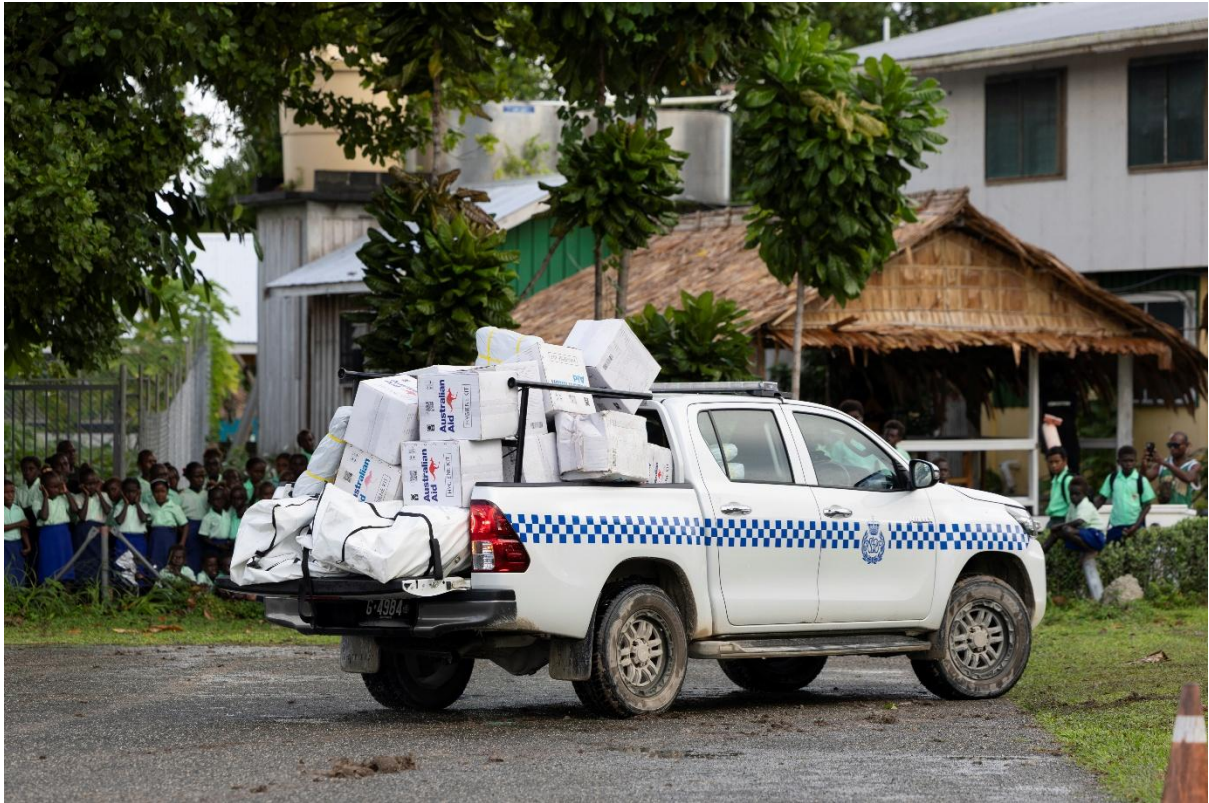
Caption 2: An RSIPF vehicle distributes Australian humanitarian assistance on Taro Island.