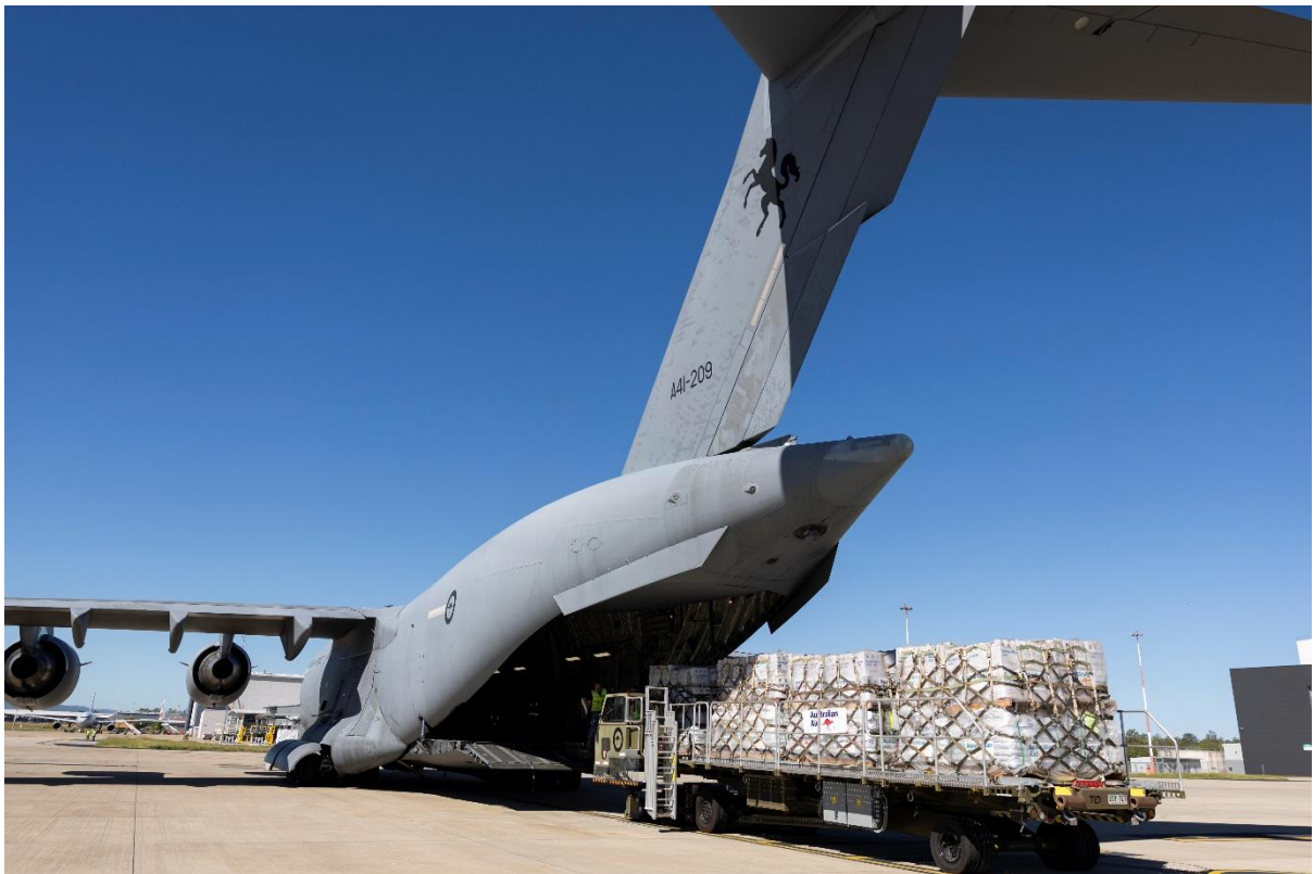
Caption 3: Australian Defence Force (ADF) members load Australian aid onto a Royal Australian Air Force C-17 Globemaster III in Brisbane.