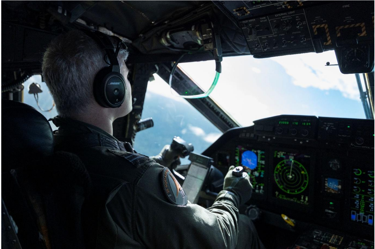
Caption 4: A RAAF pilot flies a C-27 Spartan aircraft after delivering supplies to Taro Island.