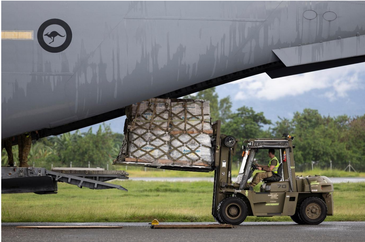
Caption 6: Royal Australian Air Force movers unload Australian aid from a No. 36 Squadron C-17 Globemaster III.