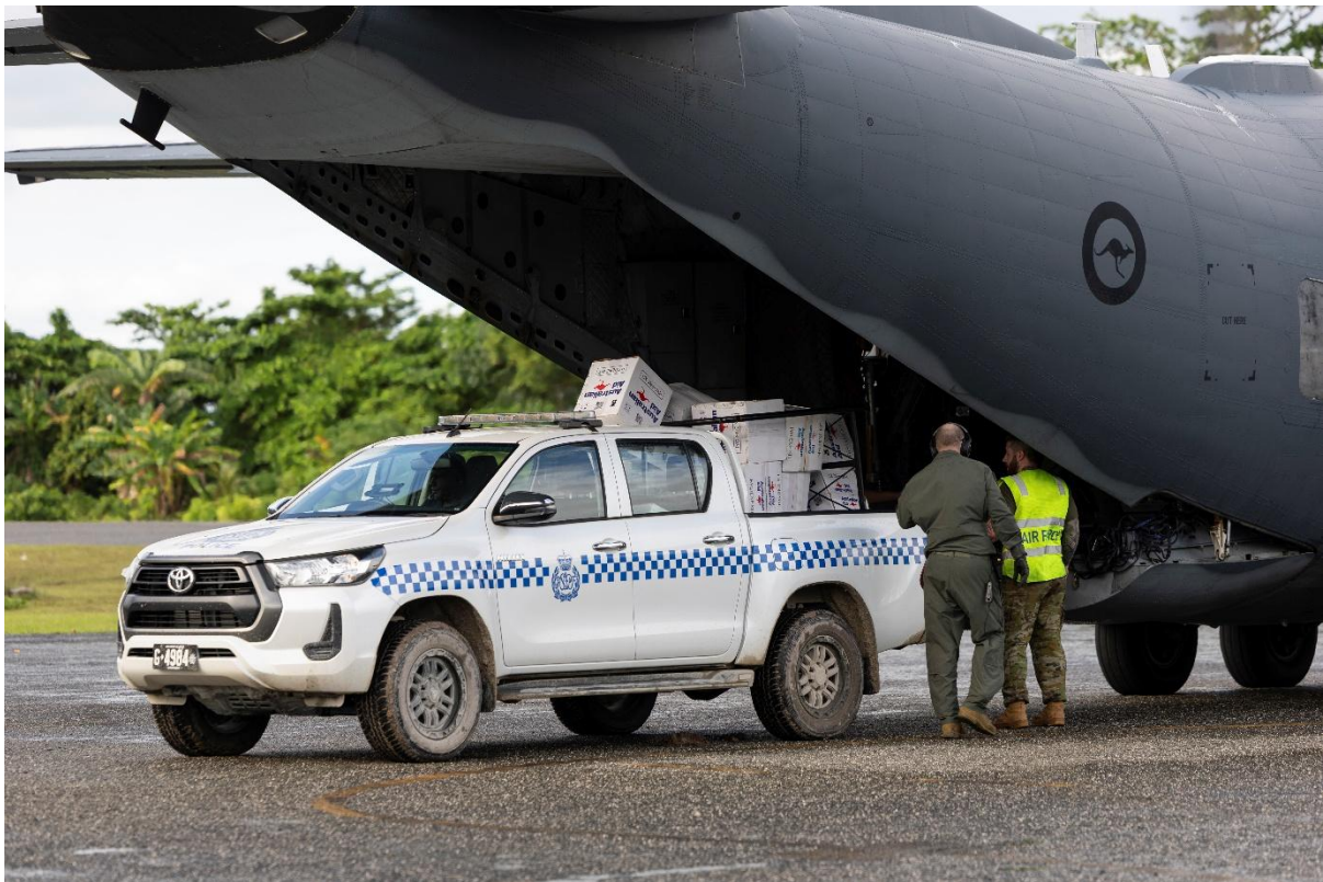
Caption 1: An RSIPF vehicle is packed with Australian aid during the Australian Defence Force support to Solomon Islands' Government in the wake of Severe Tropical Cyclone Maila.